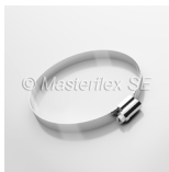
Hose clamp with worm-gear drive