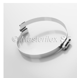
Car-Grip hose clamp, screwable