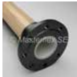
Combiflex PU fixed-flange, Inline