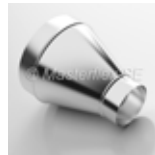
Hose reducer, symmetrical