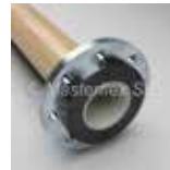
Combiflex PU Swivel Flange for Master-PUR Inline

Masterduct, Inc. 5235 Ted Street Houston, TX 77040 USA Tel. +1 713 462-5779 Tel. +1 800 318-3300 Fax +1 713 939-8441 www.Masterduct.com