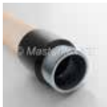
Combiflex metal male threaded socket