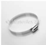
Hose clamp with worm-gear drive