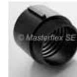
Combiflex PU Threaded Socked, pre-fixed