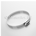
Hose clamp with worm-gear drive