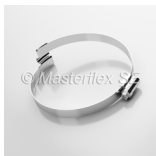
Master-Grip hose clamp, screwable