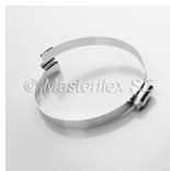
Car-Grip hose clamp, screwable