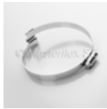
Car-Grip hose clamp, screwable