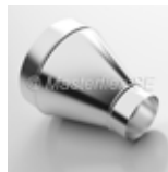
Hose reducer, symmetrical

Masterduct, Inc. 5235 Ted Street Houston, TX 77040 USA Tel. +1 713 462-5779 Tel. +1 800 318-3300 Fax +1 713 939-8441 www.Masterduct.com