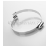
Clip-Grip hose clamp