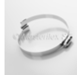
Clip-Grip hose clamp