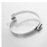
Clip-Grip special hose clamp