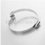
Clip-Grip special hose clamp