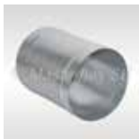
Hose connector screwable