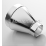
Hose reducer, symmetrical