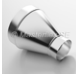
Hose reducer, symmetrical