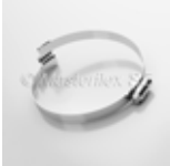
Clip-Grip hose clamp, screwable